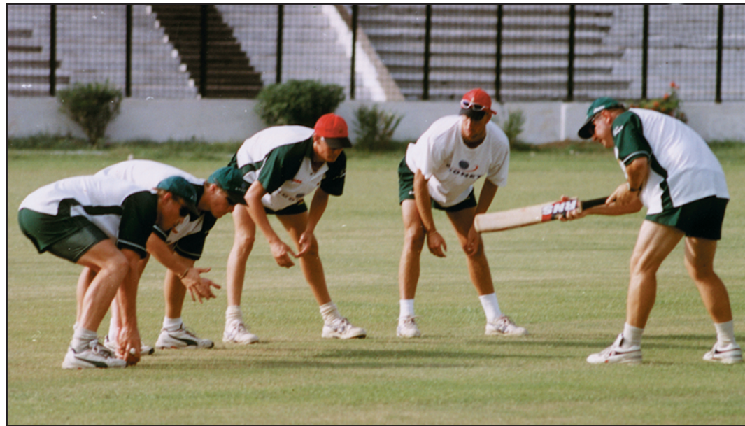
Geoff Marsh, former Australian Test opener and now coach of the Zimbabwean national team, conducts a catching practice session at the Bangabandhu National Stadium yesterday.