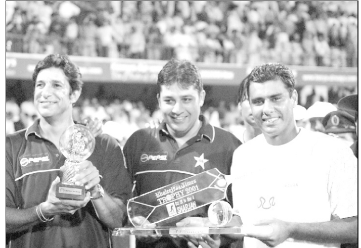
Pakistan captain Waqaar Younis (R) and his deputy Inzamamul Haq (C) hold the Khaleej Times Trophy while fast bowler Wasim Akram shows his individual performance award after the final against Sri Lanka in Sharjah on November 4.