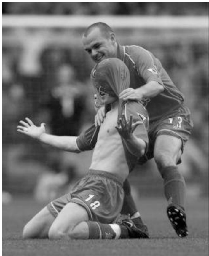
John Arne Riise, Liverpool's Norwegian star, is over the moon after his strike against Manchester United at Anfield yesterday. Teammate Danny Murphy (R) rushes in to congratulate.

The shaven-headed shot-stopper's errors have already cost United dear this season with two