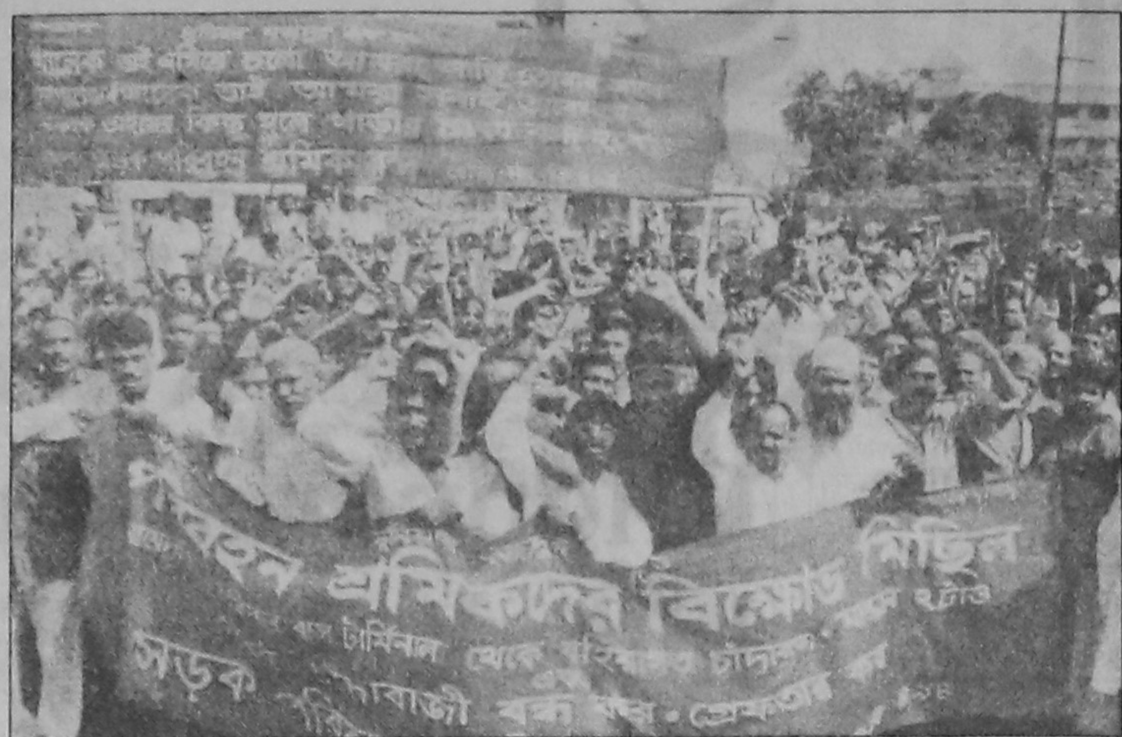
Transport workers staged a demonstration in the city yesterday demanding the arrest of illegal toll collectors from the Sayedabad and Gullistan bus terminals.

UNB, Mymensingh State Minister for Energy and Mineral Resources A K M Mosharraf Hossain yesterday said the government would soon take decision on exporting gas. "Country's development could not be possible keeping oil and gas under the soil," he said while speaking at a reception accorded to him by officers, students and employees of Mymensingh Medical College Hospital. Referring to what he called gas-selling agreements made by Awami League with foreign companies, he said they (AL) are now opposing selling of gas after losing power. "If these agreements are implemented, we will have to generate power by purchasing gas at USD 2.8 per cubic feet," he said, adding "We should protect the country's interest by canceling these agreements, if necessary." The reception was also accorded to local MPs Delwar Hossain Khan, Dr Mohammad Ali and Shah Nurul Kabir. Chaired by Dr Sayedur Rahman, the function was addressed, among others, by Dr A Z M Zahid Hossain, Dr Mohammad Ali Siddiqui and Dr A K M Waliullah.