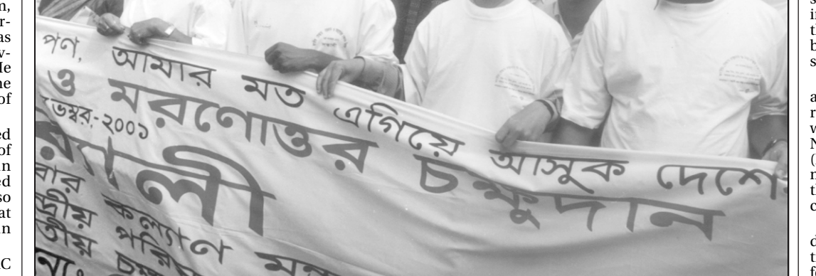
A colourful procession was brought out in the city yesterday to mark the 7th National Voluntary Blood Donation and Posthumous Eye Donation Day.

"We confirm that we have hit a US plane. We saw it going down in Char Bolak district but we're still waiting for details," said Sher Shah