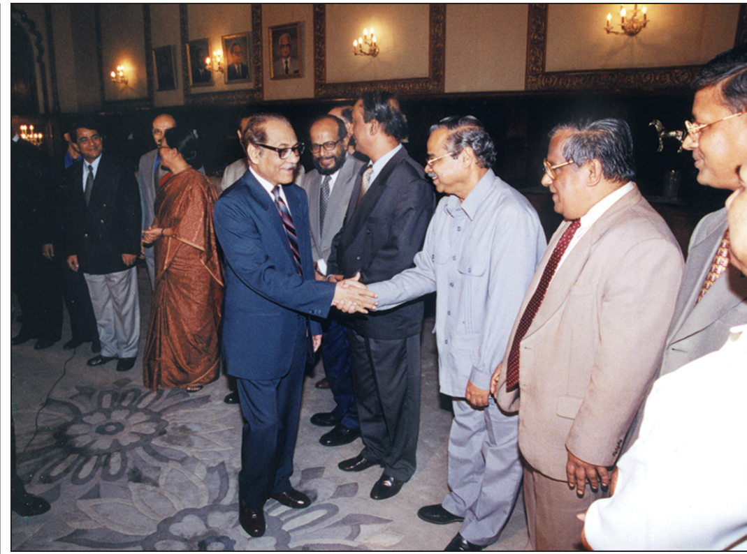
President Shahabuddin Ahmad shakes hands with a guest at the tea party he hosted for secretaries of different ministries and top army officers at the Banghabhan yesterday.