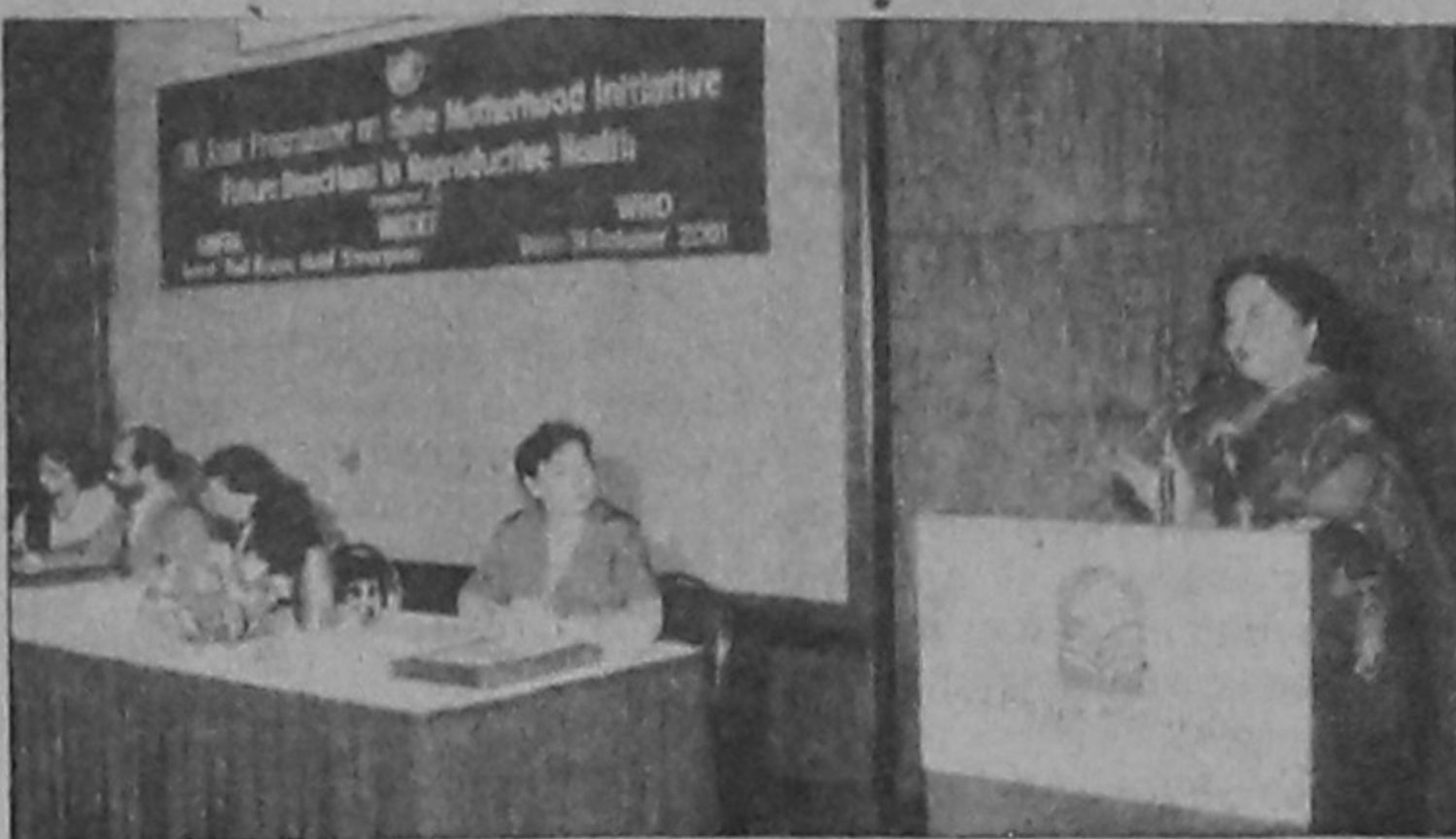
Three United Nations agencies in Bangladesh formally launched a joint programme to address safe motherhood in Bangladesh under which UNFPA, Unicef and WHO will assist the government to upgrade hospitals, give training to birth attendants, nurses and doctors and health technologists and improve existing facilities.