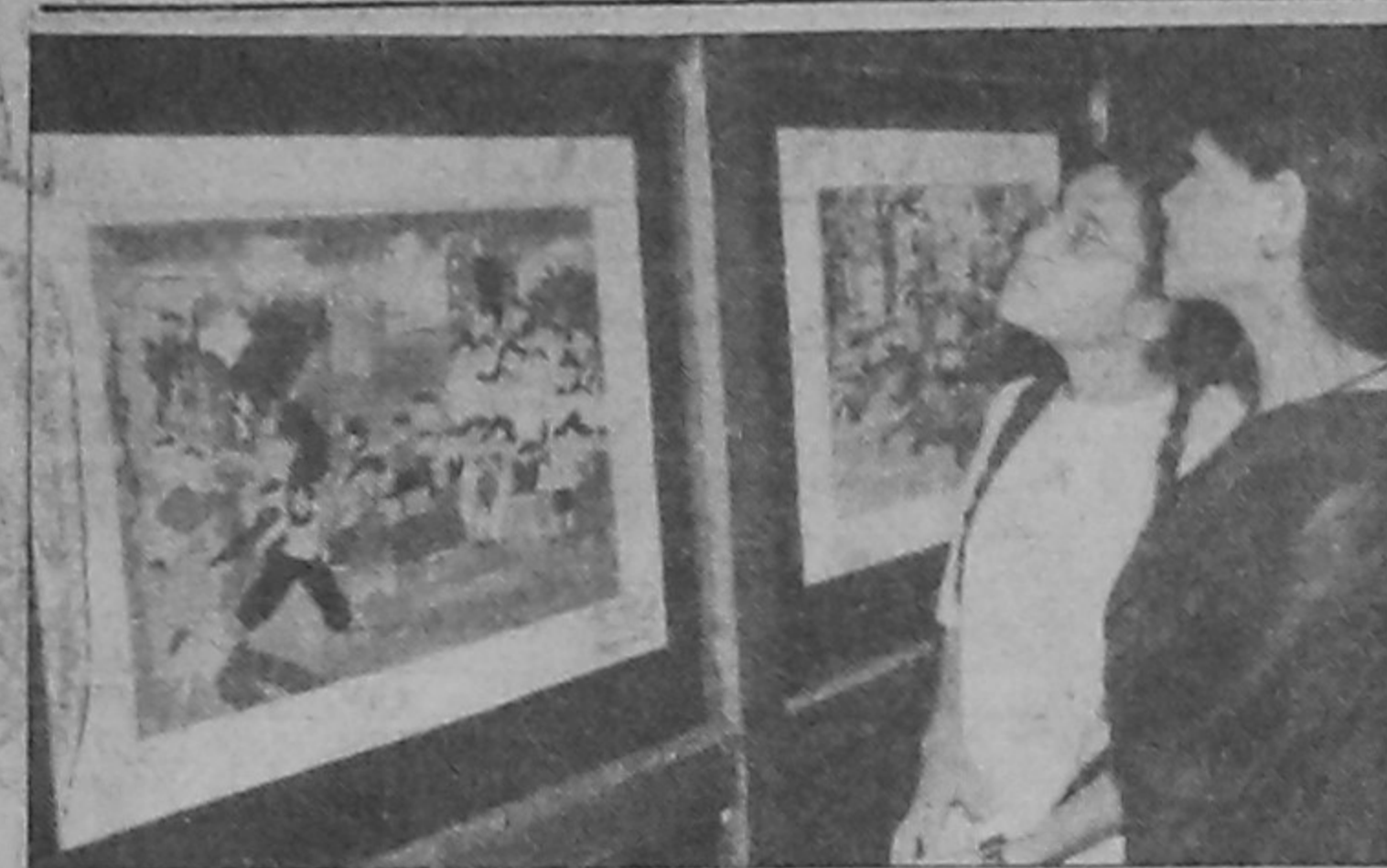
Bangladesh Institute of Law and International Affairs organised a painting exhibition at its Dhanmondi office on Tuesday to express solidarity with the affected children of the attacks on World Trade Centre and Pentagon, USA.

UNB, Dhaka Although country's maternal mortality rate (MMR) has dropped to 3.0 per 1000 have births from 4.1 in 1991, more than 10,000 women die annually due to pregnancy related complications.