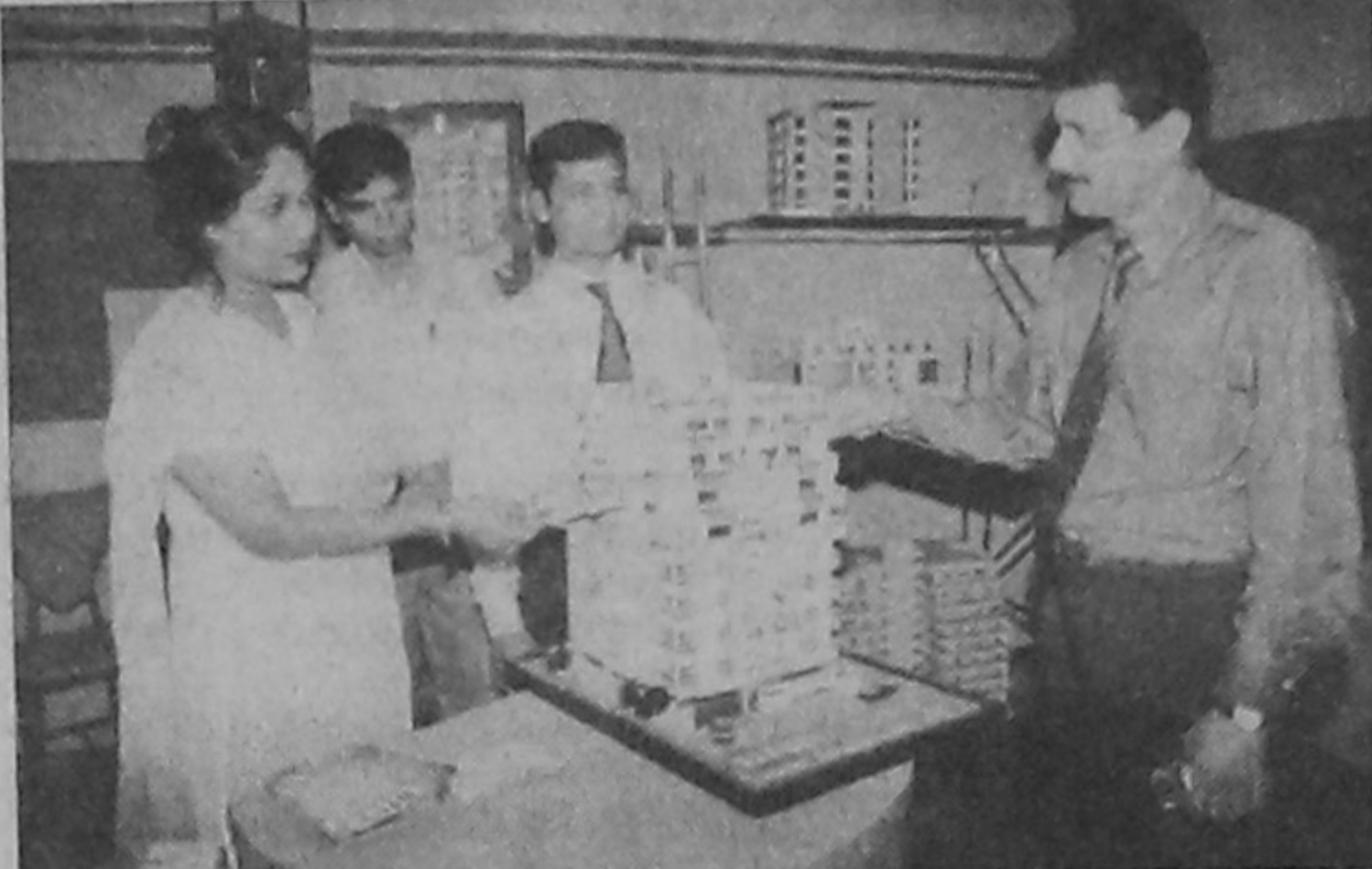
PHOTO: STAR DBH Property Fair-2001 began yesterday at the Sheraton Hotel. Picture shows a stall at the fair.