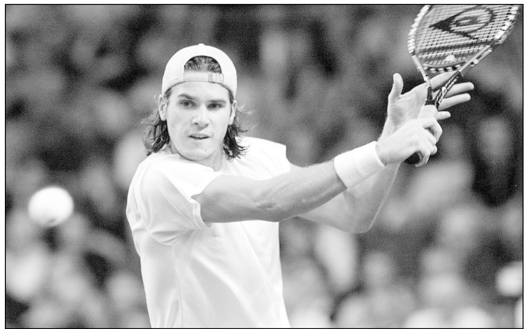
German Tommy Haas plays a backhand return against Australian Lleyton Hewitt at the Masters Series tournament on October 20.

Former Australia pace bowler Jeff Thomson said on Sunday New Zealand had no chance of beating world champions Australia in the three-Test series starting on November 8. "Yeah, I give New Zealand a chance," Thomson said.