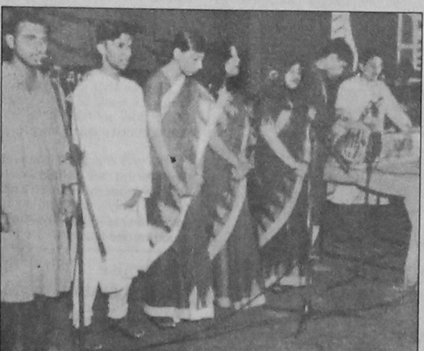
A cultural function was organised by the Association of the Mechanical Engineering students at the BUET central auditorium recently.