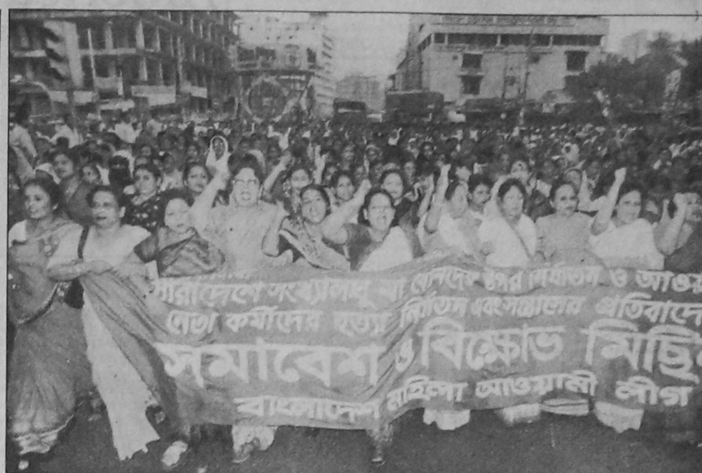
Bangladesh Mohila Awami League took to the streets yesterday to protest the continuing attacks on minorities in the country.