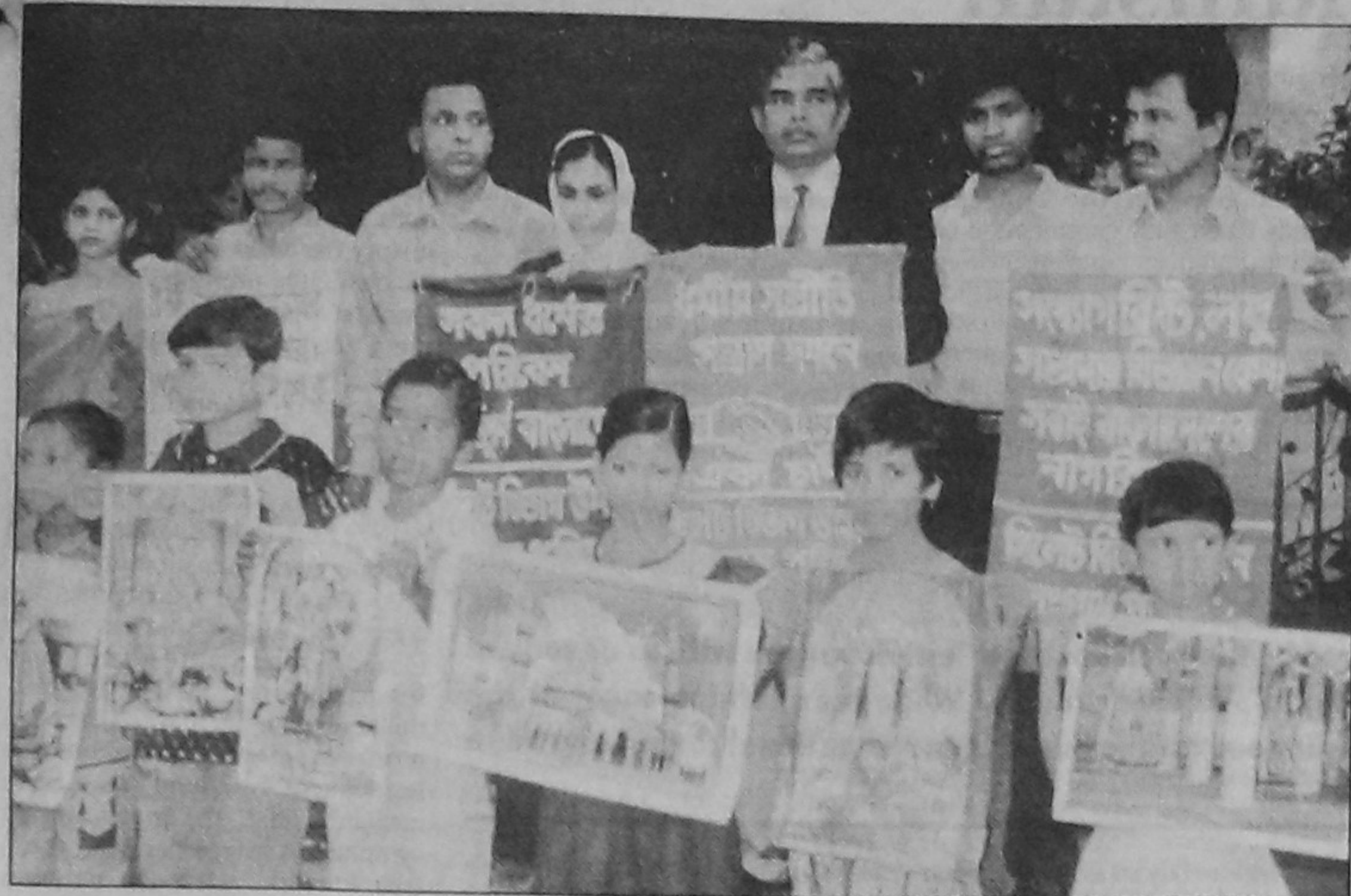
Sylhet Bibhag Unnayan Sangram Parishad organised formation of a human chain in front of the National Press Club yesterday to protest the attacks on members of the minority communities of the country.