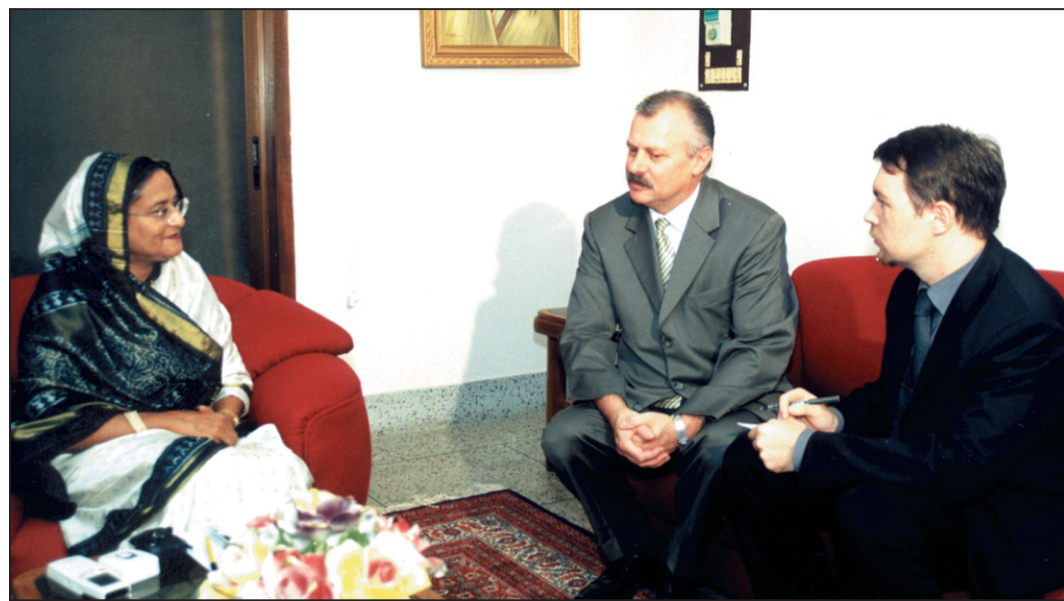
Awami League President Sheikh Hasina listens to the newly appointed Russian envoy to Bangladesh during a meeting at her Dhanmondi residence yesterday.