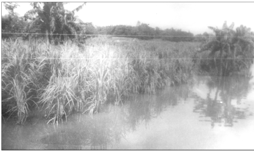
(From left to right) A sugarcane field in Gobindaganj upazila of Gaibandha has been submerged by flash flood while the river Karotoa is about to devour a village situated on its bank near the same upazila.