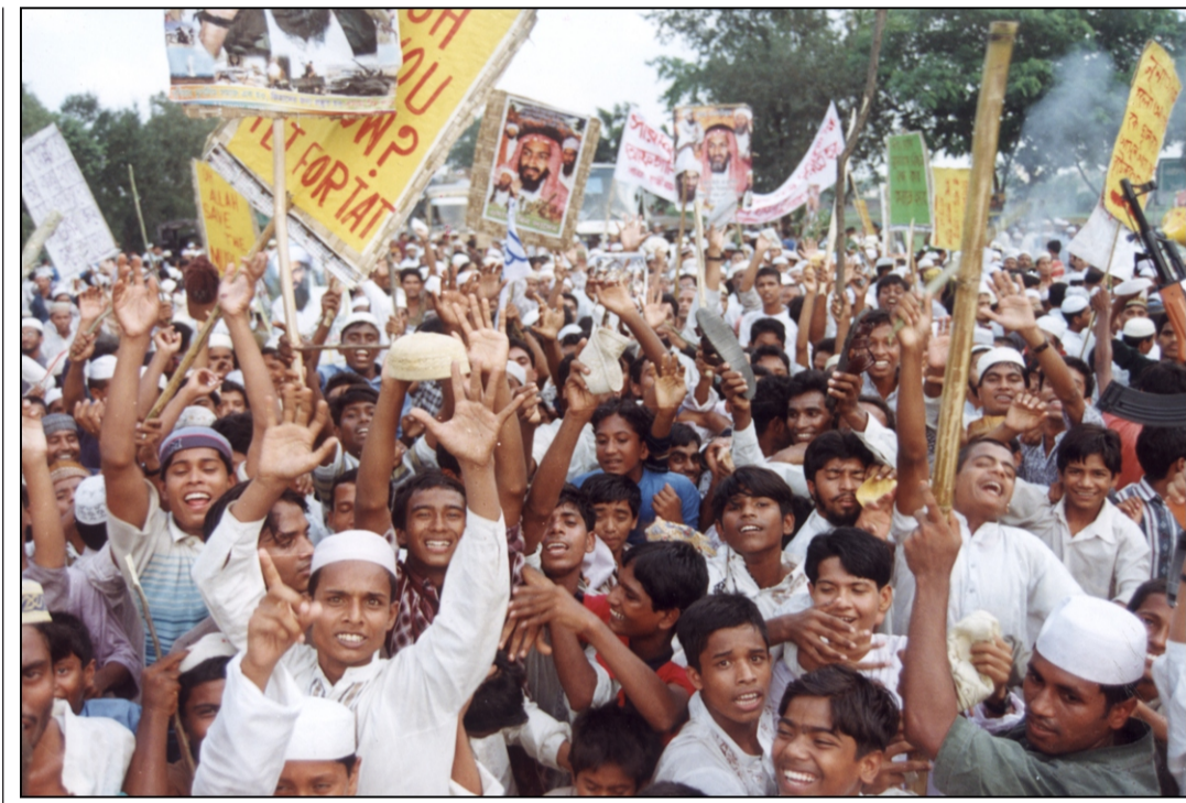
A procession under the banner of 'Touhidi Janata' was brought out after Juma prayers yesterday, disrupting traffic at Matuail point on Dhaka-Chittagong Highway for an hour.

BNP secretary general and LGRD Minister Abdul Mannan Bhuiyan has asked the city unit president and general secretary, eight MPs of Dhaka city, members of the national executive committee and central presidents and general secretaries of different front organisations to attend the meeting.