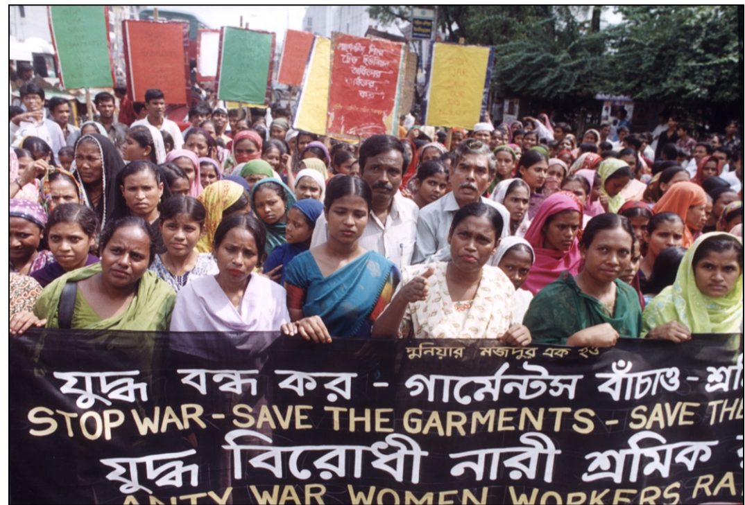
Anti-war women workers took out a procession in the city yesterday, urging US to stop war in Afghanistan which is affecting Bangladesh's garment sector.