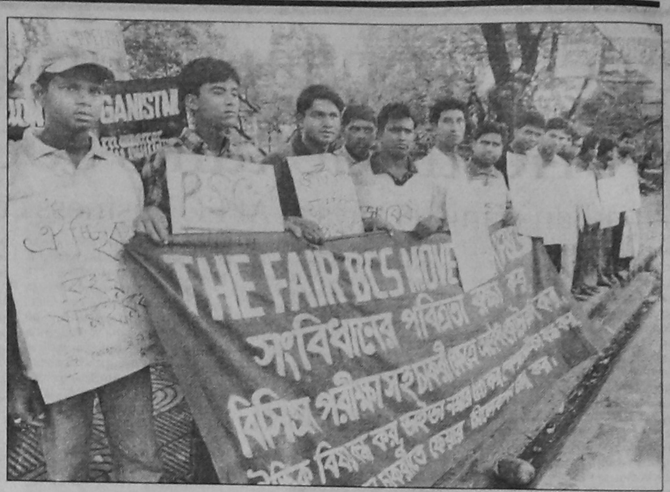
The 'Fair BCS Movement' demonstrated in front of the National Press Club yesterday demanding an end to all illegal quota system in the public examinations for jobs under Bangladesh Public Service Commission.

She earlier expressed her fear to the Caretaker Government that the members of the minority communities would be barred from participating in the general elections which was utterly erroneous.