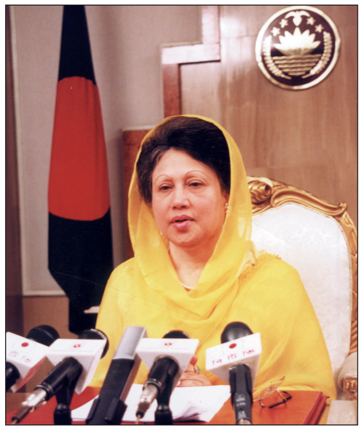
Prime Minister Khaleda Zia addressing the nation last night.