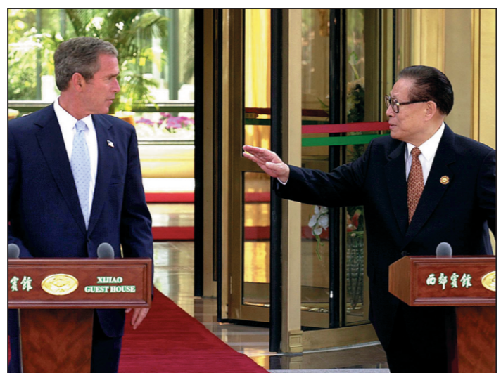
Chinese President Jiang Zemin making a point during the joint press conference with his US counterpart George W Bush (L) in Shanghai yesterday.