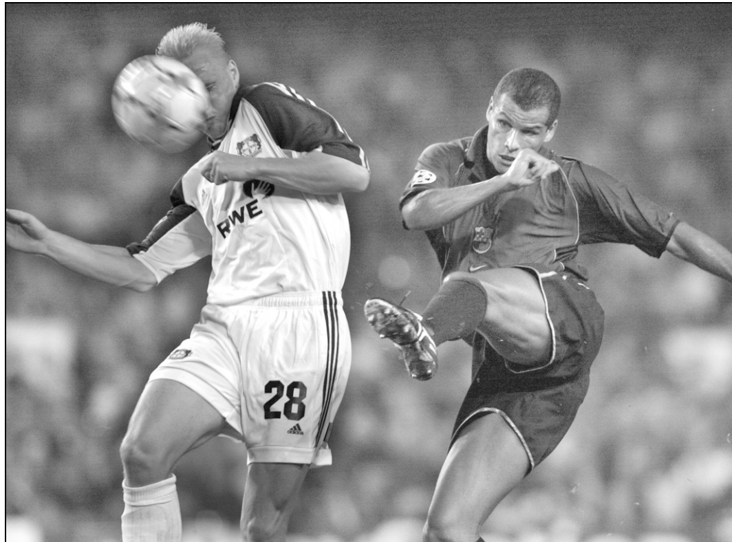
Barcelona superstar Rivaldo (R) blasts a shot past Bayer Leverkusen's Carsten Ramelow at the Nou Camp on October 17.

Further occasions came from Beschastnykh, Victor Bulatov, Yegor Titov and Vassil Baranov but they lacked precision at the crucial moment. Bayern's last counterattack brought a fifth goal. Zickler, who came on 12 minutes before the end for Brazilian Paulo Sergio, scored in injury time to complete their goal spree.