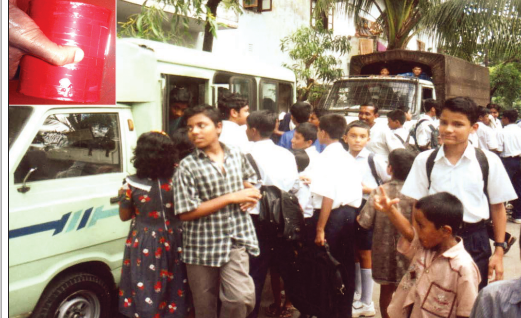
School children crowd outside the Bangladesh Bank Colony Welfare Association office at Agrabad in Chittagong wherefrom a bomb (inset) was recovered yesterday.