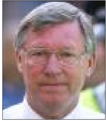
Sir Alex Ferguson

"We aren't counting the minutes," said Cech. "We simply begin each match with the determination not to concede a goal."