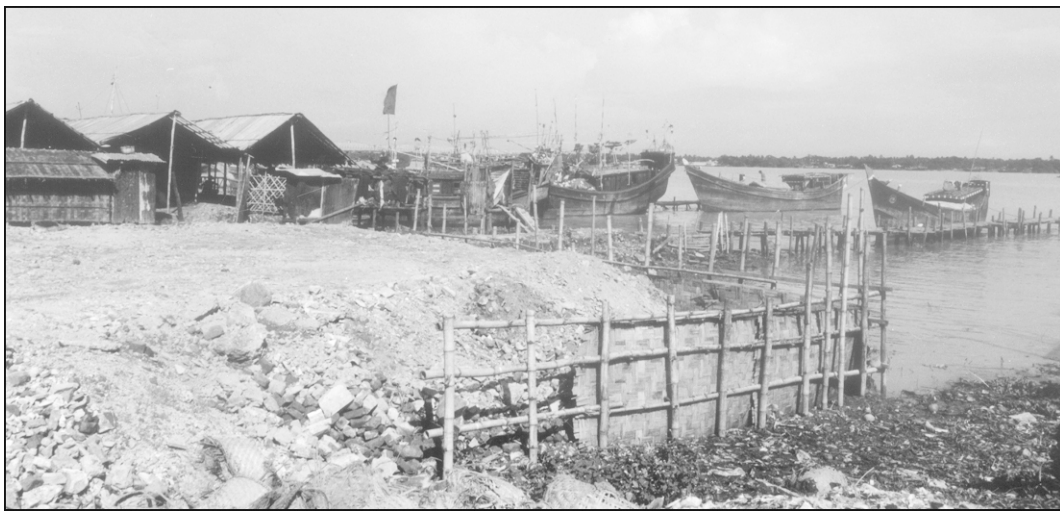
A vicious assault on the river Karnaphuli in Chittagong. A vested group filled up a part of the river at Firingi Bazaar, Yakubnagar Loita Ghat. While the earthfilling continued openly, local administration remained totally oblivious to it. The Karnaphuli has long been subjected to illegal occupation and encroachment, dangerously threatening the ecology of the area.

UNB, Rangpur Rangpur Dinajpur Rural Service (RDRS), Bangladesh has allocated relief materials and cash worth Tk 25 lakh to 2000 tornado-affected families of two upazilas of Lalmonirhat and Nilphamari districts. Some 2000 families of Kaliganj in Lalmonirhat and Kishoreganj in Nilphamari districts will be given Tk 10 lakh for rebuilding their houses while remaining 15 lakh for foodstuff, clothing and tube-wells. At least nine people were killed and over 700 injured in the tornado that hit 15 villages of six upazilas of Lalmonirhat, Nilphamari, Gaibandha and Rangpur districts on Friday.