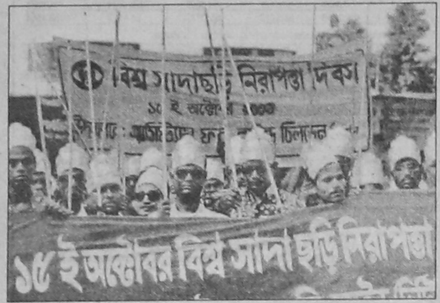
A procession was brought out in the city yesterday to mark World White Car Safety Day. The procession was organised by different NGOs.