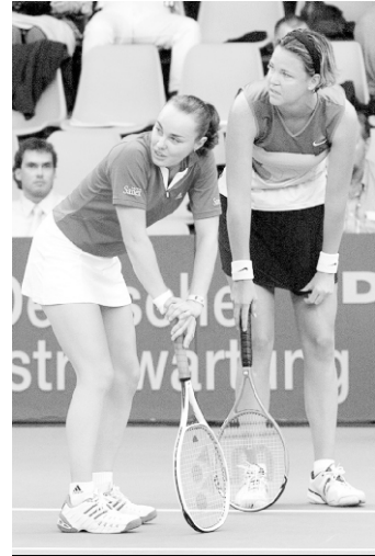
Swiss Martina Hingis (L) leans on her racquet after falling during her semifinal match against American Lindsay Davenport at the Porsche Gran Prix on Saturday.

Hingis later underwent a scan in Zurich, but still hopes to participate