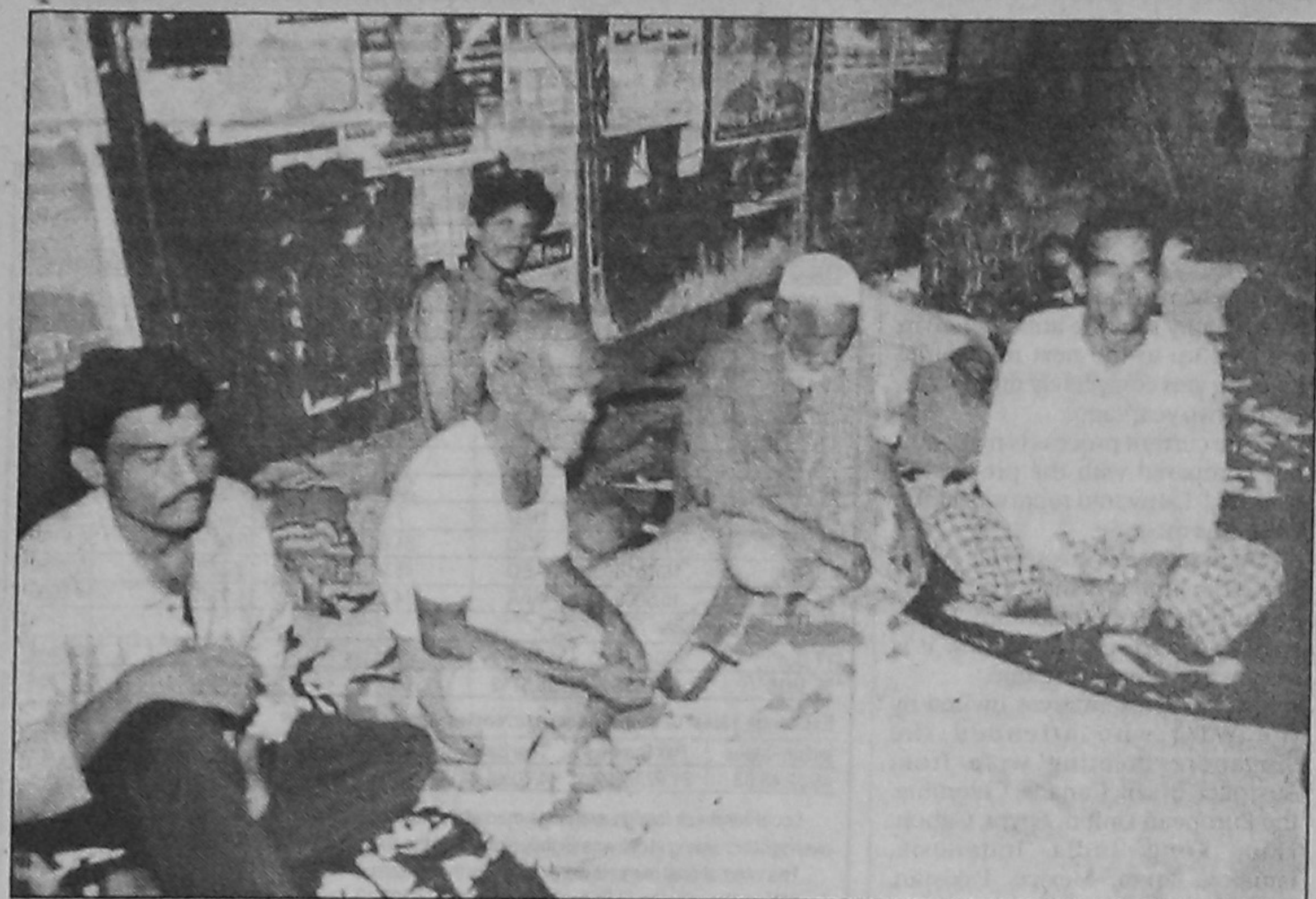
Awami League workers and supporters who have fled their homes in different parts of the country to escape repression take shelter at the party's central office in the city yesterday.