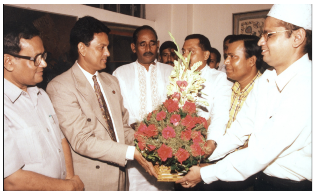
First day in office: Staff of the Education Ministry presenting a bouquet to Ehsanul Haq Milon, state minister for education and deputy minister Abdus Salam Pintu in the chamber of Education Minister Dr Osman Faruk at the Secretariat yesterday.