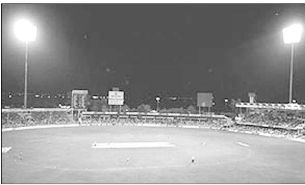
A night-time Sharjah Stadium which so far has staged 174 one-day internationals.