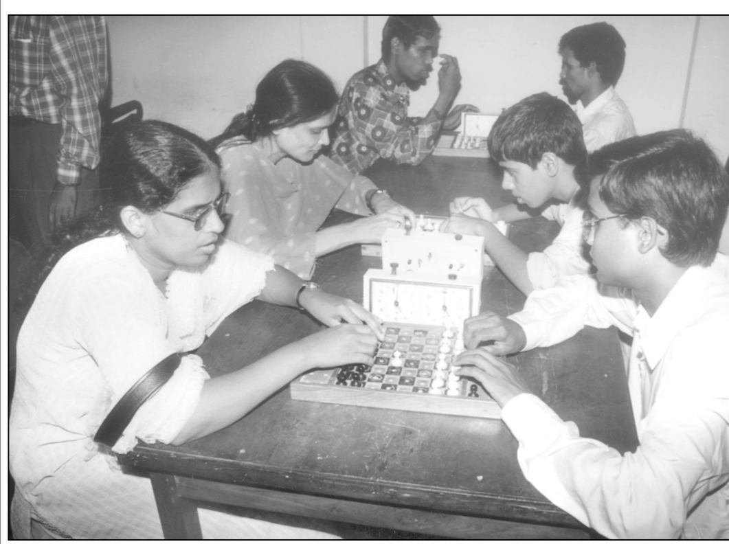
Blind players are absorbed in cerebral warfare on the opening day of the Third National Chess Competition for People with Visual Impairment at the NSC yesterday.

The New Zealanders will be desperate for Cairns, Vettori and Nash to avoid more injury problems this summer if they want to push the SEE PAGE 15