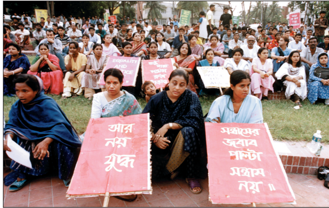
Naripakkha activists display posters and placards, condemning acts of terrorism both on national and international fronts, during a rally at Mukta Mancha in the city's Dhanmondi area yesterday.