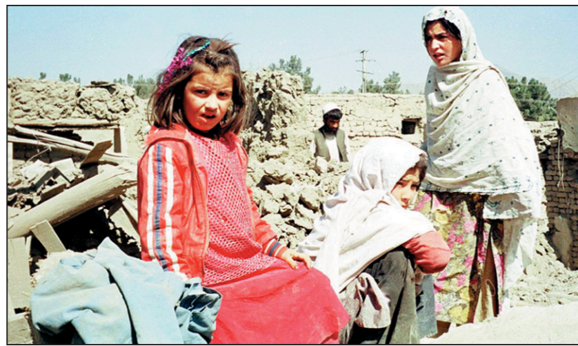
Afghan girls sit on the debris of their home destroyed by a bomb dropped early yesterday on Qala-e-Wakil in Afghan capital Kabul (left), and away in Ismailiya, US aircraft carrier USS Theodore Roosevelt crossing the Suez Canal yesterday on its way to the Indian Ocean. The carrier will join the fleet taking part in the strikes against Afghanistan.