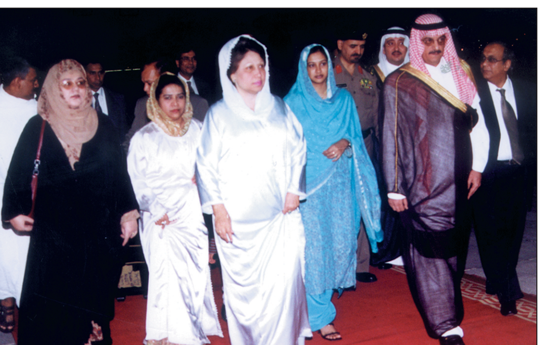
Prince Abdullah bin Fahd, Deputy Governor of Makkah, received Prime Minister Khaleda Zia at King Abdul Aziz