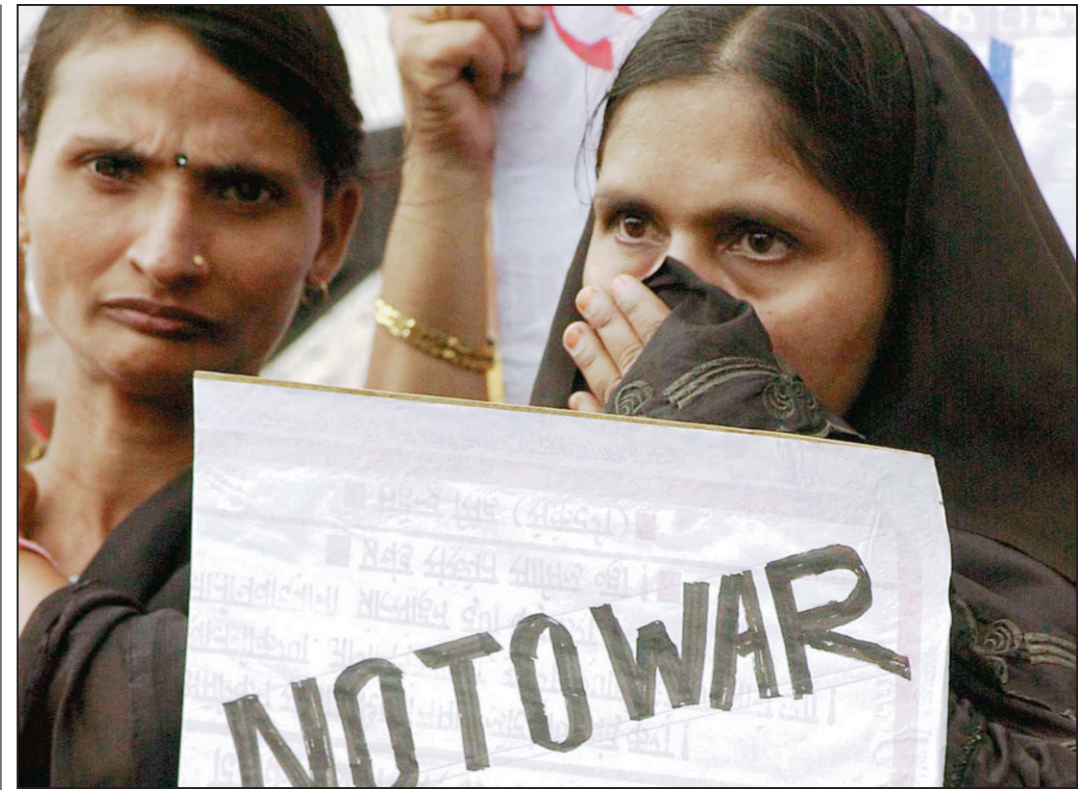
Muslim women hold placards during a peace rally at Churchgate station yesterday in south Bombay. The women's organisation urged for peace and an end to the bombing of Afghanistan.