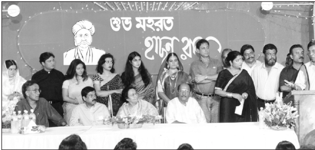
Actors, actresses, director, producer and guests of the mahurat pose for a shot at the FDC on October 8