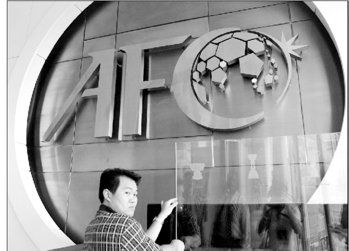
A worker putting the final touches on the new Asian Football Confederation (AFC) logo at the organisation's headquarters in Kuala Lumpur on October 10.

The Asian Football Confederation (AFC) Wednesday demanded five automatic berths in the 2006 World Cup as it unveiled a new logo to spur the "magical" game in Asia.