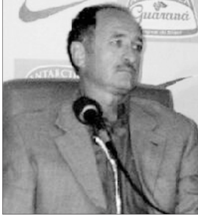
Brazil coach Luis Felipe Scolari at a press conference in Rio de Janeiro on October 9.

After Brazil's 2-0 win against Chile coach Luis Felipe Scolari can afford to feel more than slightly relieved, but he knows that the road ahead is a tortuous one. The World Cup qualifiers will be wrapped up in November, with games against Bolivia on the 8th of November in La Paz, and on the 14th versus Venezuela, with the venue still to be confirmed.