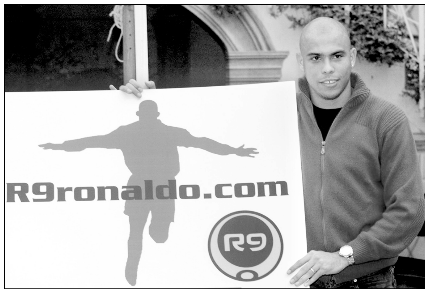
RONALDO ON THE NET: Brazil and Inter Milan superstar Ronaldo smiles during a photo shoot on the occasion of the launching of his internet website R9ronaldo.com at Milan on October 9.

Atalanta were fined nearly 11,000 dollars for the behaviour of their fans while Brescia earned a fine of just less than 1,500 dollars. Mazzone, angered by comments made by Atalanta fans, ran 60 metres to celebrate in front of opposing supporters after his team's late equaliser, making gestures and shouting at them.