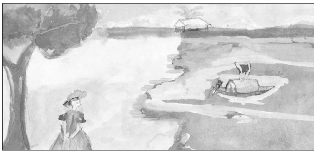
This landscape is by a young learner from the past workshop

The painting workshops conducted by Masuma Khan, split into different age groups, are held once a week, every Friday.