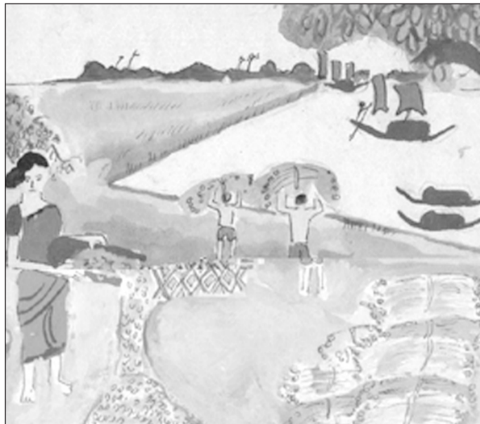
Beauteous Bengal by a student

war of liberation in 1971 and the bravery of the Bengali people created an indelible impression in Masuma's mind. Many of her works is actually a narration of the pain and sufferings of the war. The bird's nest with three chicks about to be devoured by a devilish serpent is suggestive of the fate of the unfortunate Bengalis of this part of the world during those nightmarish days of 1971.