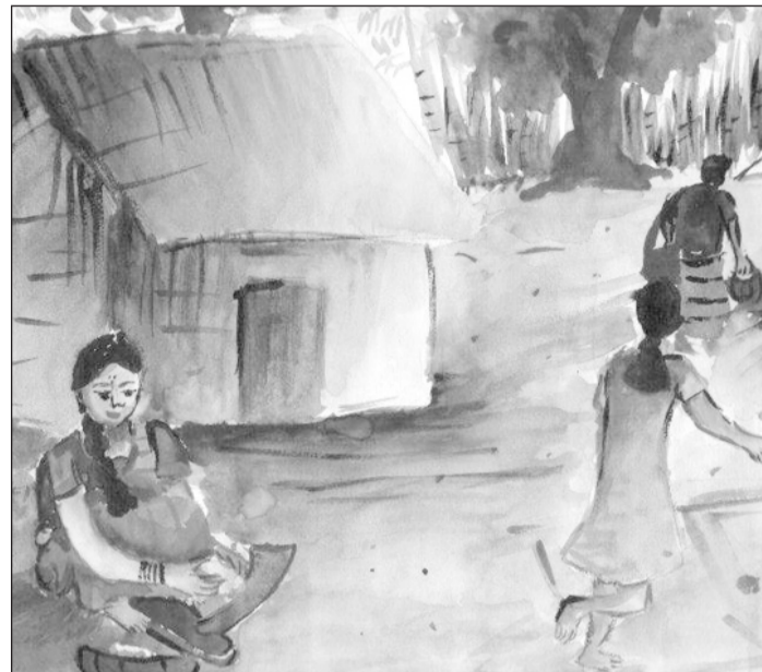
This picture is a fine depiction of rural life in Bangladesh

"I strongly believe that a child should always be given a