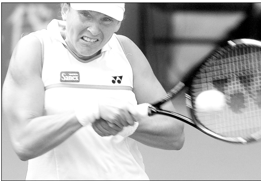
Monica Seles in action at the Kiwi Cup in Shanghai yesterday.