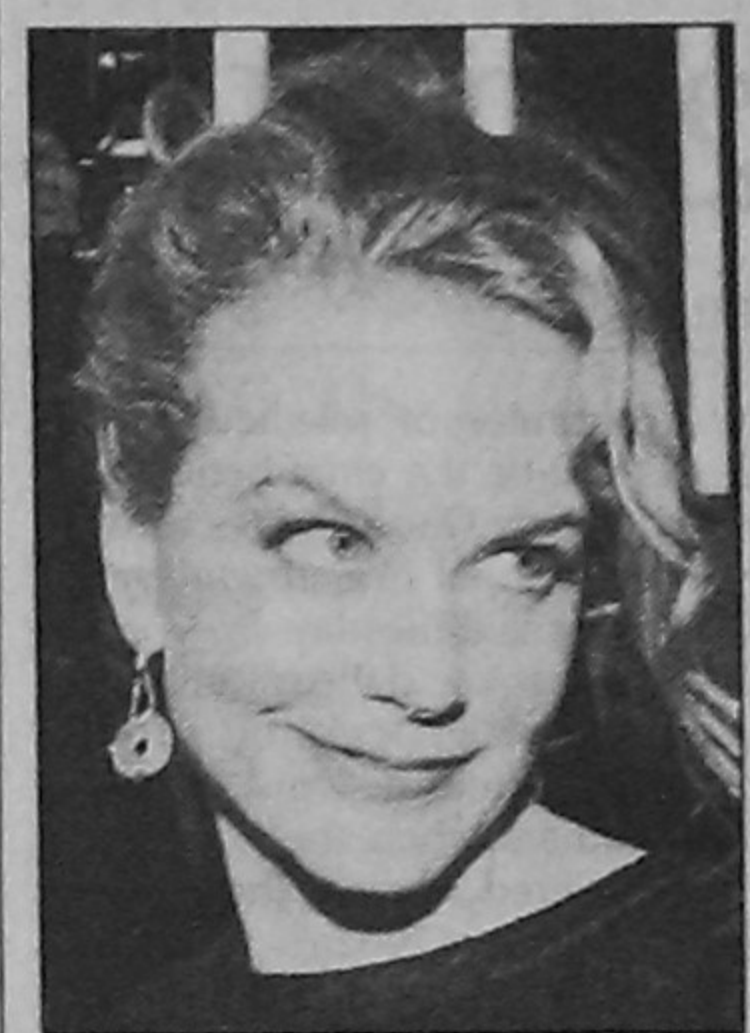
AUSTRALIAN ACTRESS NICOLE KIDMAN ARRIVES IN BERLIN YESTERDAY FOR THE PREMIERE IN GERMANY OF 'MOULIN ROUGE' BY DIRECTOR BAZ LUHMAN.

AFP, London The BBC apologised to British Prime Minister Tony Blair yesterday after a correspondent speculated on television about the premier's overseas travel plans, despite pleas not to do so for security reasons. Downing Street complained to BBC director general Greg Dyke after comments by war correspondent Kate Adie. A spokesman for Blair said: "We are aware of the Kate Adie report and we are making a formal complaint at the highest level to the BBC because repeated representations at a lower level have been unsuccessful." The BBC said the incident had happened "inadvertently" and added: "This should not have happened and we have apologised to the prime minister's office." A spokesman said: "We have again reminded all our staff that the BBC will not be the first to break directly any embargo regarding the prime minister's travel plans, nor would we encourage others to do so." Meanwhile, Downing Street refused to confirm press reports that Blair, who had been engaged in a frantic round of shuttle diplomacy to shore up the US-led coalition against terrorism, was set for another trip Tuesday evening.