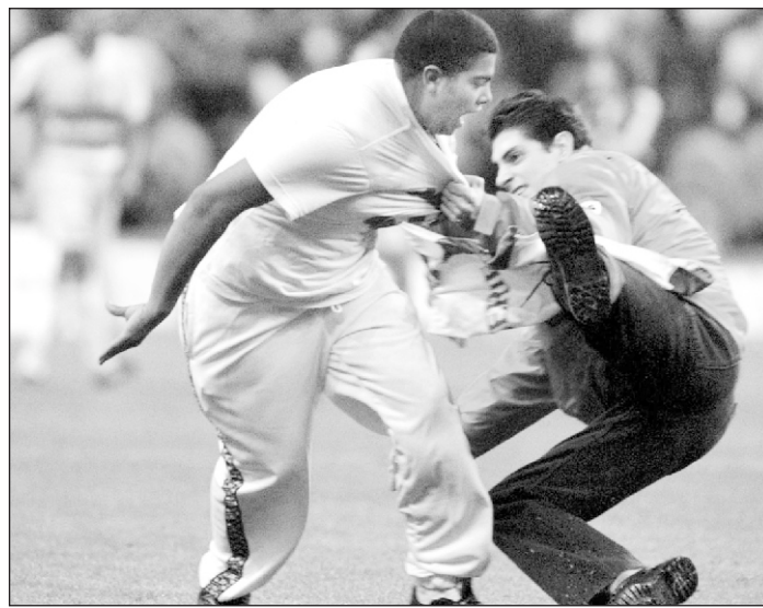
UNFRIENDLY SUPPORTERS: Unidentified spectators fight on the field in the Stade de France during the friendly soccer match between France and Algeria on October 6.

"The three points were very important, not just because it means we'll climb up the table but because of the way we got them," added Del Bosque, with noticeable relief. The defeat meant that Athletic's 100 per cent away record came to an end. "They deserved to win. We did well at times but we made too many errors and you can't do that against Real Madrid," said Athletic coach Jupp Heynckes. The German World Cup winner was standing on the sidelines at the Santiago Bernabeu stadium for the first time since his abrupt dismissal from Real Madrid in May 1998, only days after leading them to victory in the Champions' League.