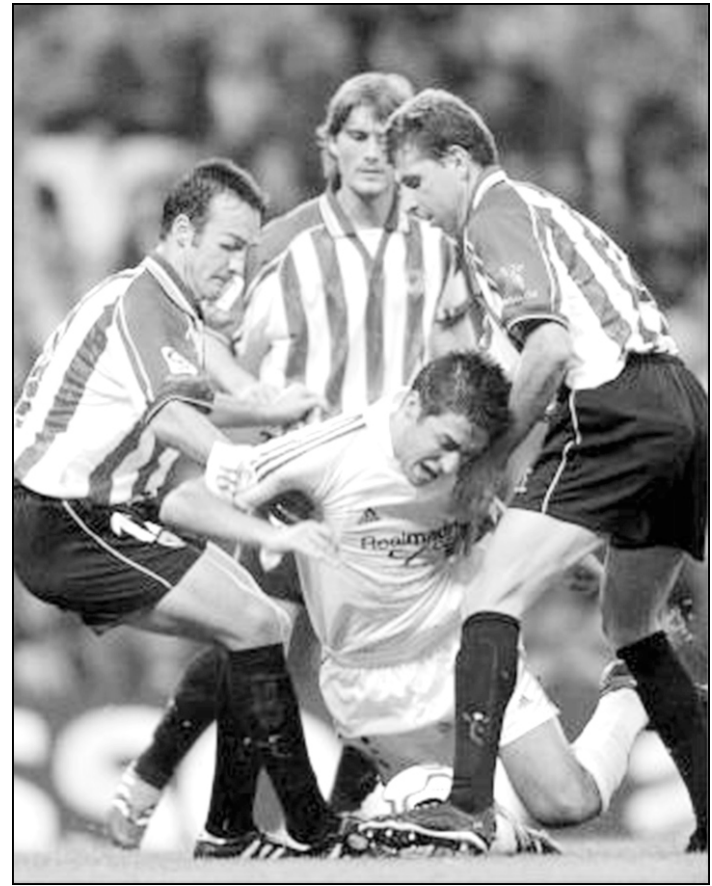
Real Madrid ace Raul struggles with three players of Athletic Bilbao in at Madrid on October 6.

the break and saw Fran connect at close range, with his left foot meeting a hopeful volley forward from Deportivo defender Enrique Romero. Fran's second, again from his favourite left foot, came after Victor Sanchez crossed across the face of the goal and the Barcelona defenders had left the former Spanish international enough space to sneak in unmarked from outside the area. Despite Deportivo's joy, the match had a poignant moment when the team stripped off after the final whistle to reveal T-shirts with slogans remembering their team mate Manuel Pablo.