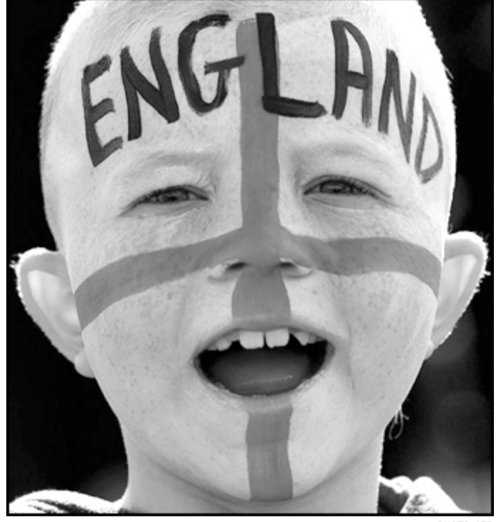
FACE OF ENGLAND: A young English fan poses for a photographer before start of the England-Greece World Cup qualifier at Old Trafford on October 6.

England win group and qualify for World Cup Finals. Germany play Ukraine in play-off against Ukraine