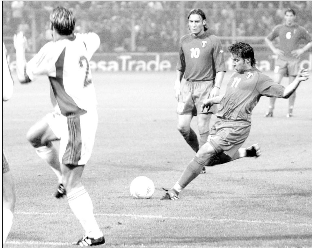
Striker Alessandro Del Piero (R) is about to take the scoring free-kick against Hungary in their World Cup qualifier in Parma on October 6.

"It was a marvellous afternoon - maybe not football-wise because I don't think we played very well today," Eriksson said.