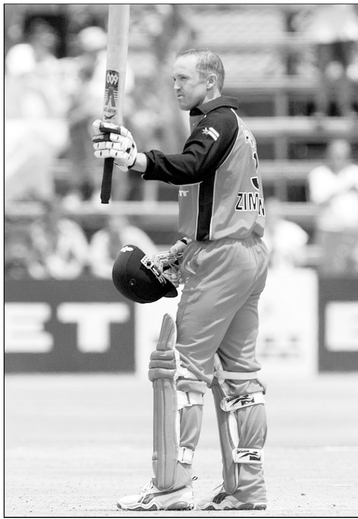
MAN-OF-THE-MATCH: Zimbabwe superstar Andy Flower acknowledges the crowd's applause after his century against England in the third one-day international in Harare yesterday.

CCS Red: 51 all out in 20.2 overs (Imtiaz 3/5, Kashem 3/6, Shahid 3/12, Extras 22) Result: Friends Eleven won by 85 runs.