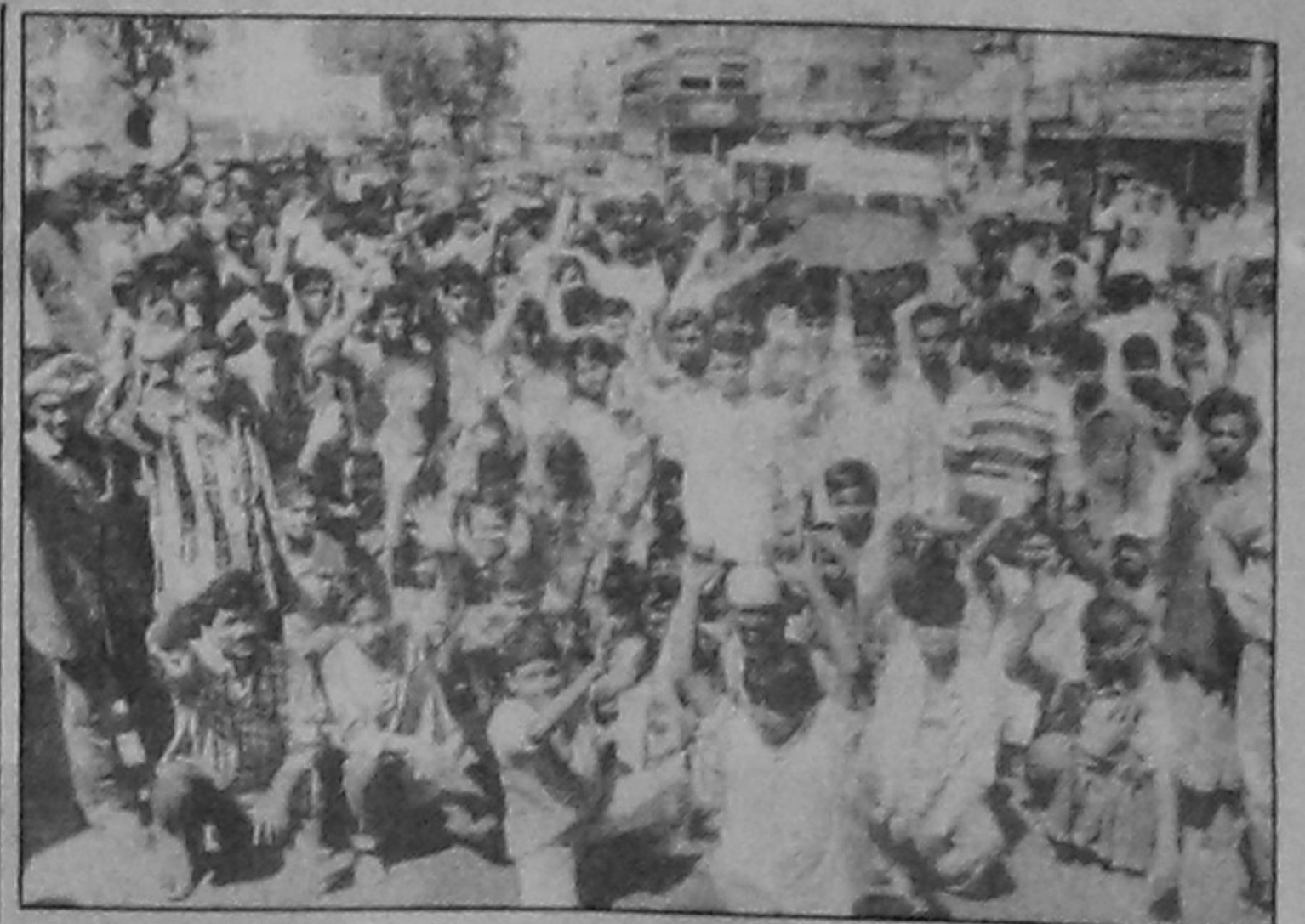
(TOP) Shopowners and their employees in Kazipara area of Mirpur staged a demonstration yesterday protesting the armed attacks on the traders in the area. (Above) Shopowners also kept the shutters down to protest the attacks.