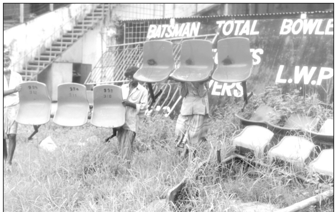
IN WITH THE NEW, OUT WITH THE OLD: The Bangabandhu National Stadium is getting ready to play host to Zimbabwe when the Africans come here in November on a 25-day tour. As part of preparation workers here are seen removing the broken chairs of the International Enclosure out of the big bowl.