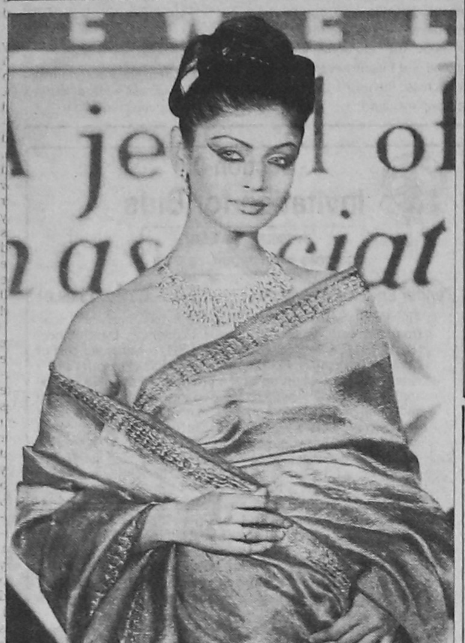
A model displays a diamond necklace at the 'Diamond Vivaha Jewellery - 2001' show at Kolkata organised by P.C.Chandra Jewellers yesterday.

United States Thursday: "Don't try to conciliate the Arabs at our expense. We won't accept it." "I call upon the western democracies, and first of all the United States as the head of the free world, not to commit again the terrible mistake made in 1938 when European democracies sacrificed Czechoslovakia for a temporary solution," he said.