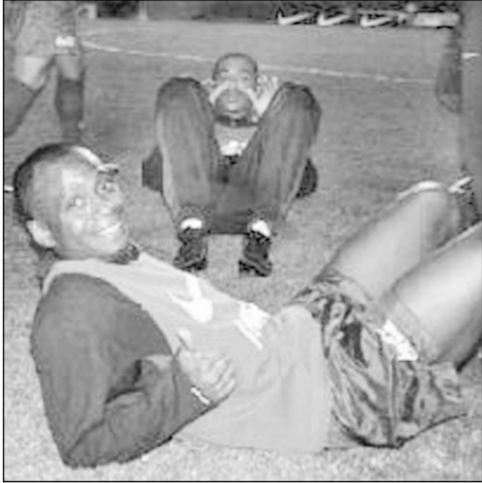
Striker Edilson gives a thumbs up while relaxing during a training session of the Brazil national squad at Curitiba on October 2.