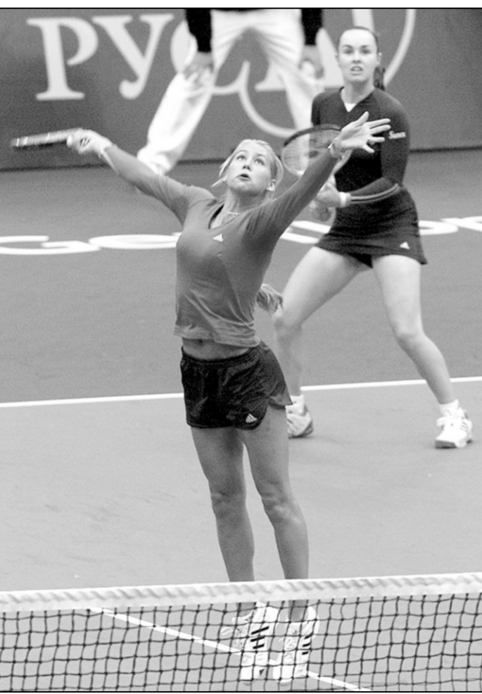
Russian Anna Kournikova and Switzerland's Martina Hingis in action at the Kremlin Cup on Monday.

"I got a cake, a painting from the mayor, a jewellery box and some champagne, it's great," Hingis said with a broad smile.