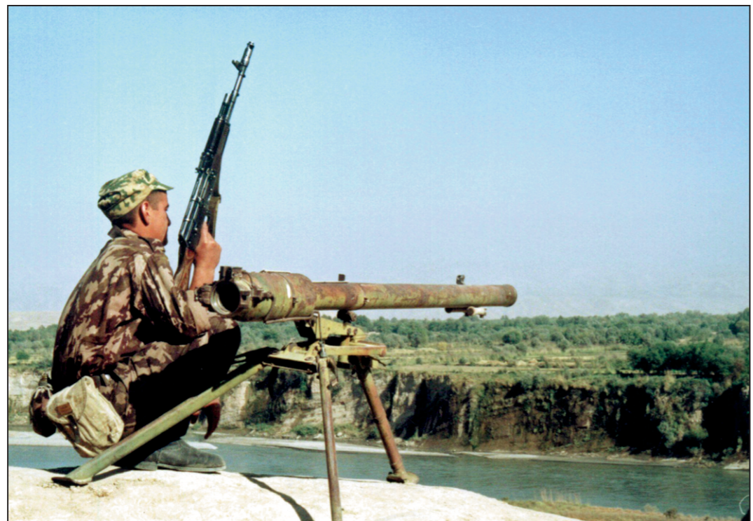
A Russian border sentinel observes the Tajik-Afghan border at a post near the village of Pyanzh. Tajikistan, a former Soviet republic, is expected to give key support to any military action against the ruling Taliban.