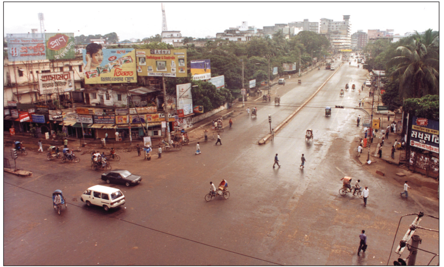
Election hangover still not over... a deserted Purana Paltan crossing yesterday shows a city trying to sleep through election hangover, a day after Monday's polls.