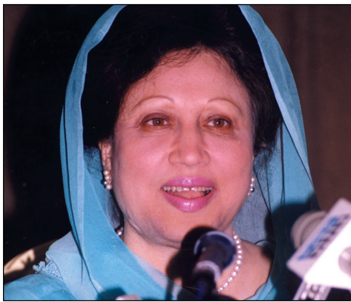
BNP Chairperson Khaleda Zia smiles as she responds to a query during a press conference at a city hotel yesterday.