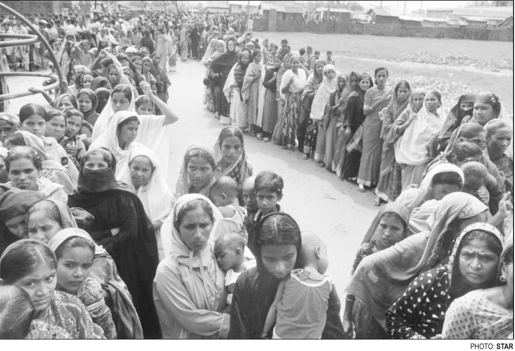
Turnout of women at the polls was relatively higher this year than previous ones. Picture shows women waiting with their little ones in their arms in long queues at Fatullah under Narayanganj district.