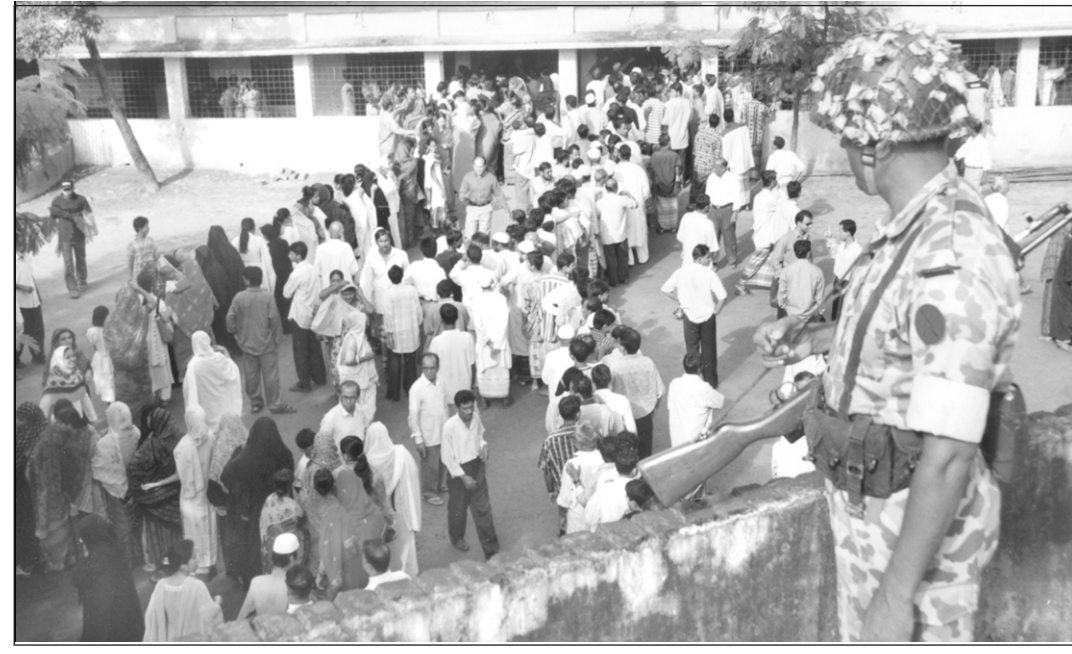
Citizens wishing to make an early start queuing up at a polling centre at Haricharan Roy Road at Sutrapur at 7.30 in the morning, all polling centres officially opened at 8 in the morning.