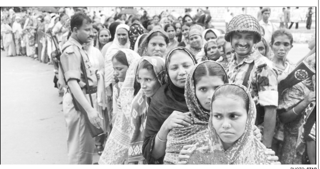
An army personnel smiles during an exchange of words with voters in a queue at a polling centre at Baghbazar.