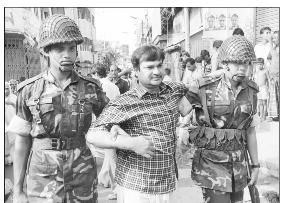
Army personnel helping a handicapped man at a centre in Old Dhaka.