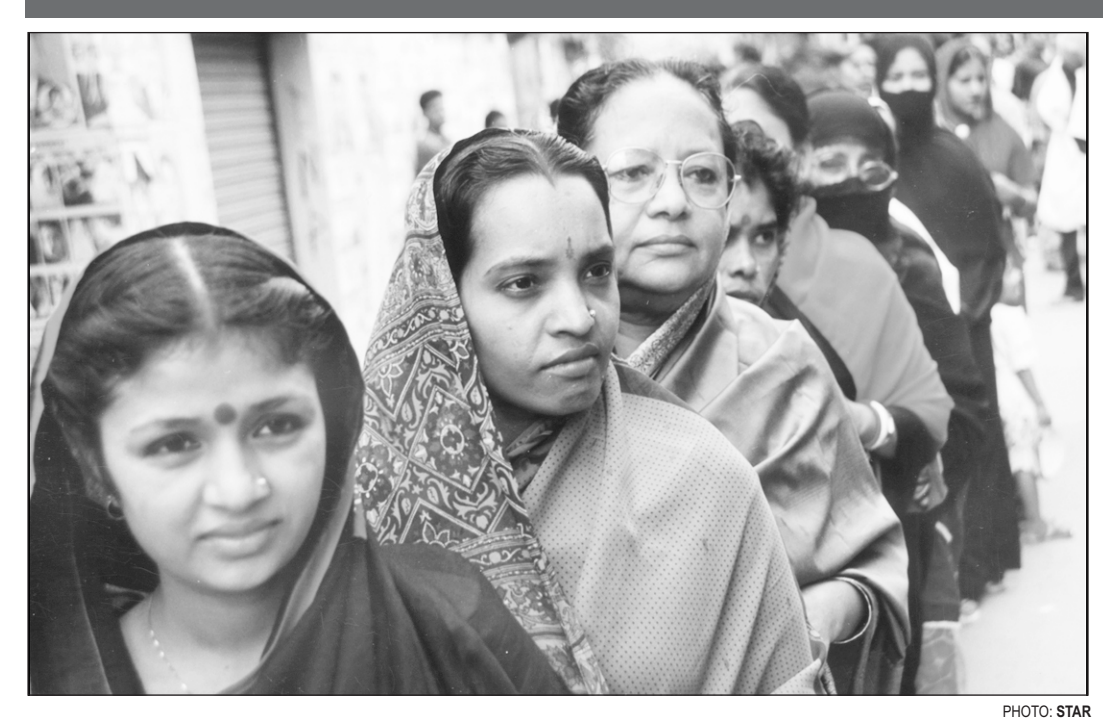
Women belonging to the Hindu community queuing up to exercise their right to franchise at a voting centre at city's