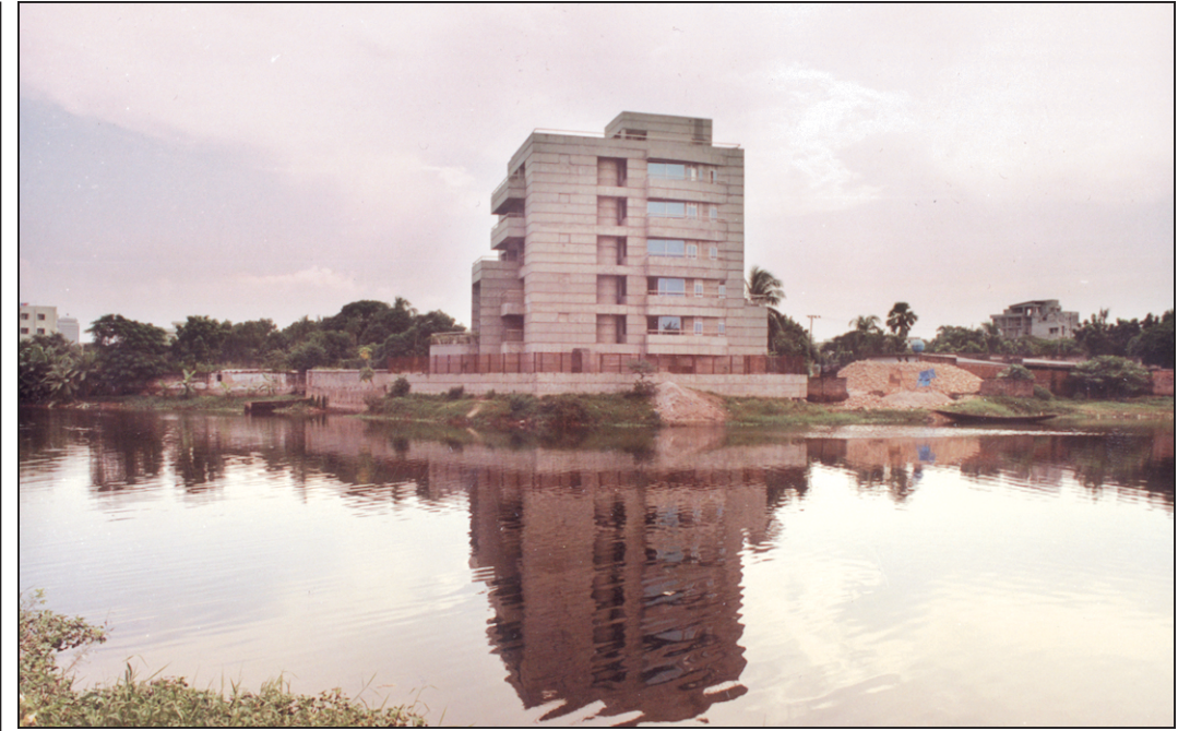
The beleaguered lake... Gulshan-Banani-Baridhara Lake would be filled up at two different points to construct roads to connect Banani with Gulshan.