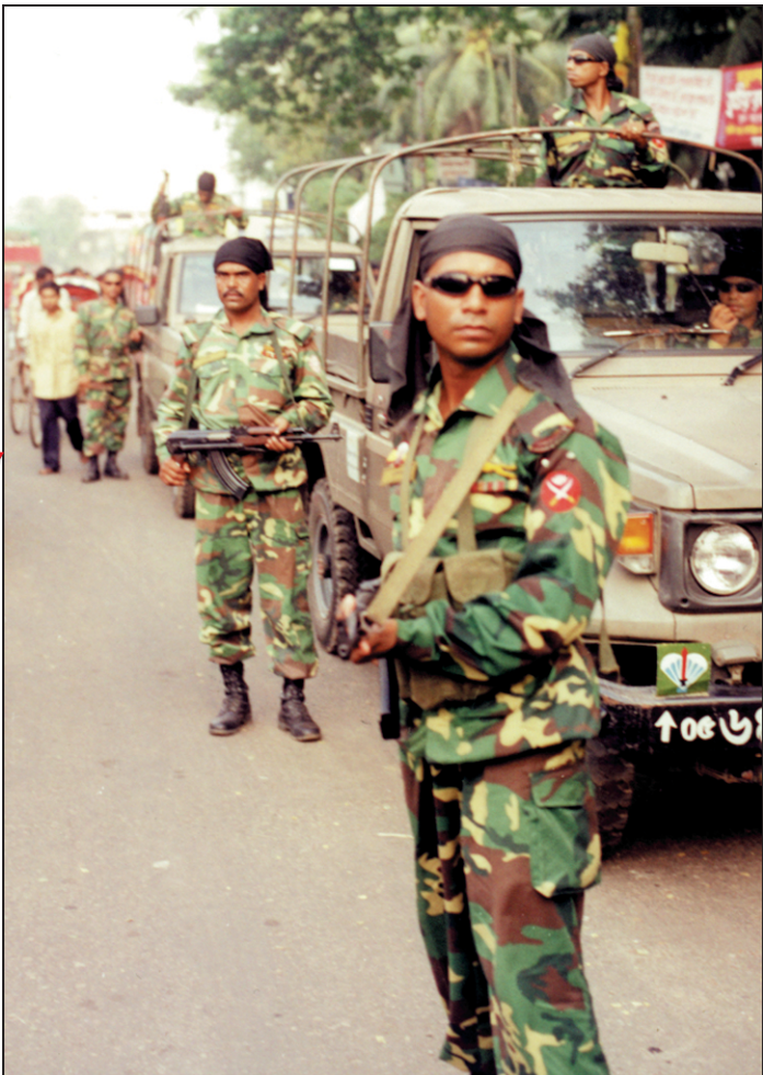
Elite commandos of the Army carrying light machine guns and wearing black bandanas patrol city points as part of election duty.