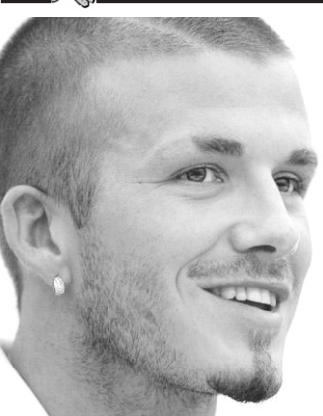
David Beckham (England soccer captain) "I want to stay captain for the rest of my career."