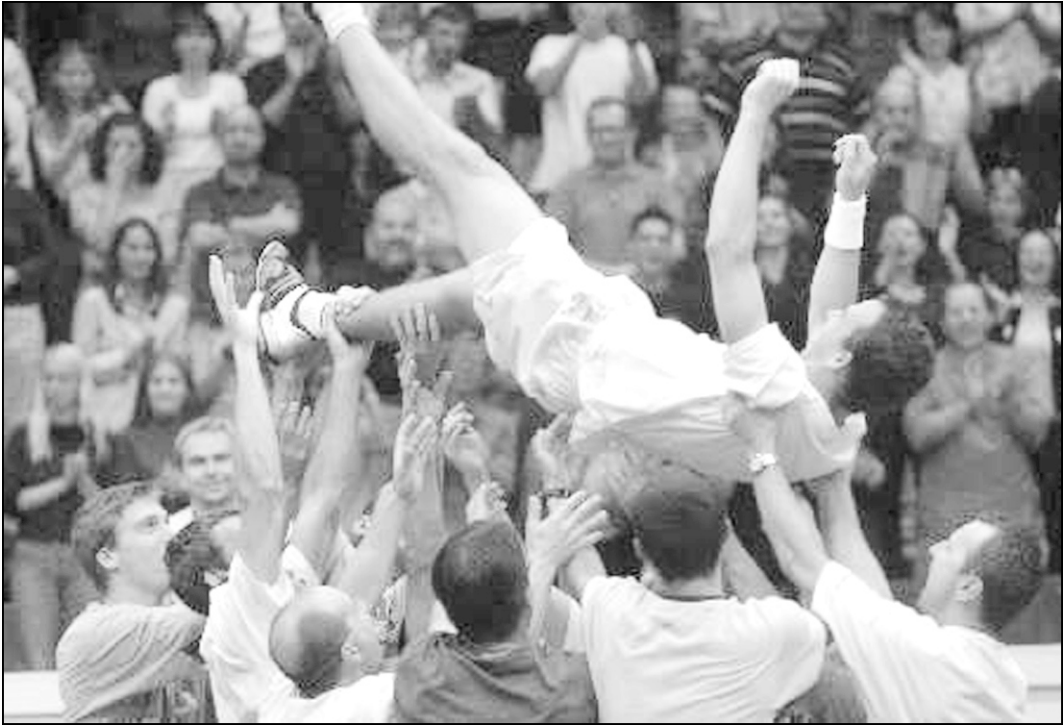
Dominik Hrbaty of Slovakia is thrown in the air by his teammates after he defeated Marcelo Rios of Chile in their Davis Cup World Group qualifier in Presov.

we wanted to maintain that record and we certainly did that."