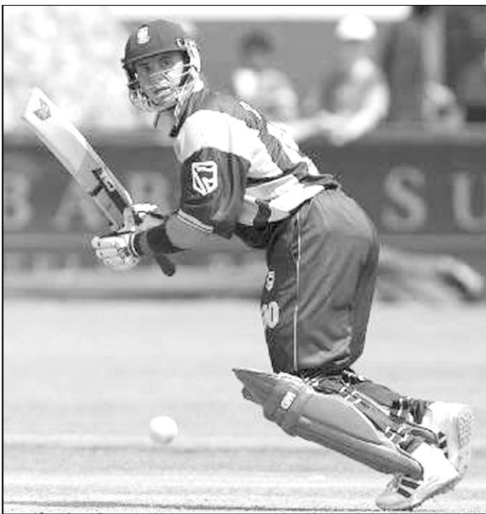
South African opener Herschelle Gibbs flicks during his 125 against Zimbabwe yesterday.

Left-handed opener Alistair Campbell hit a spirited 81 off 117 deliveries before being deceived by a slower ball from South African captain Shaun Pollock.