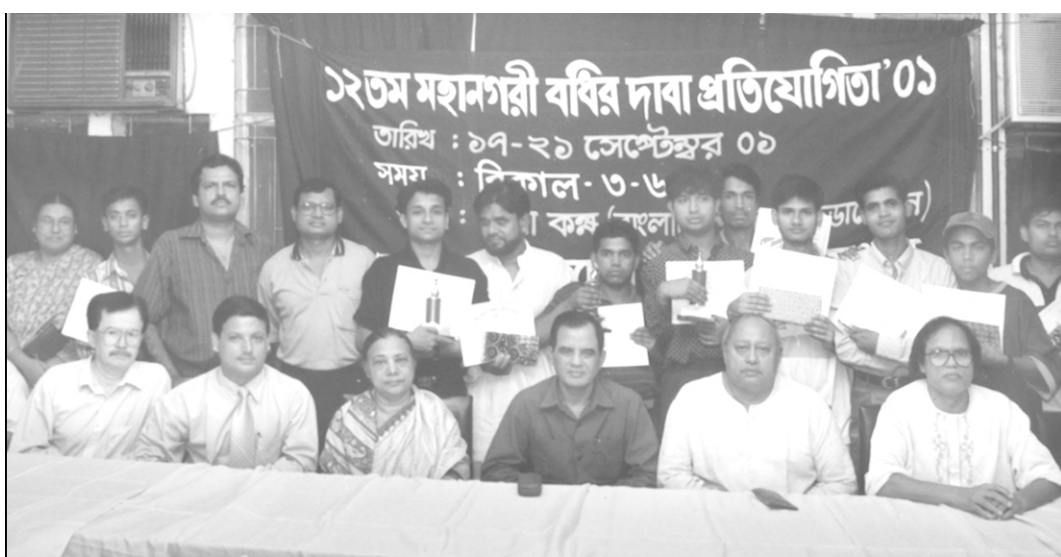
Winners of the 12th Dhaka Metropolis Deaf Chess tournament pose with the guests at the NSC on Friday at the end of the five-day event.