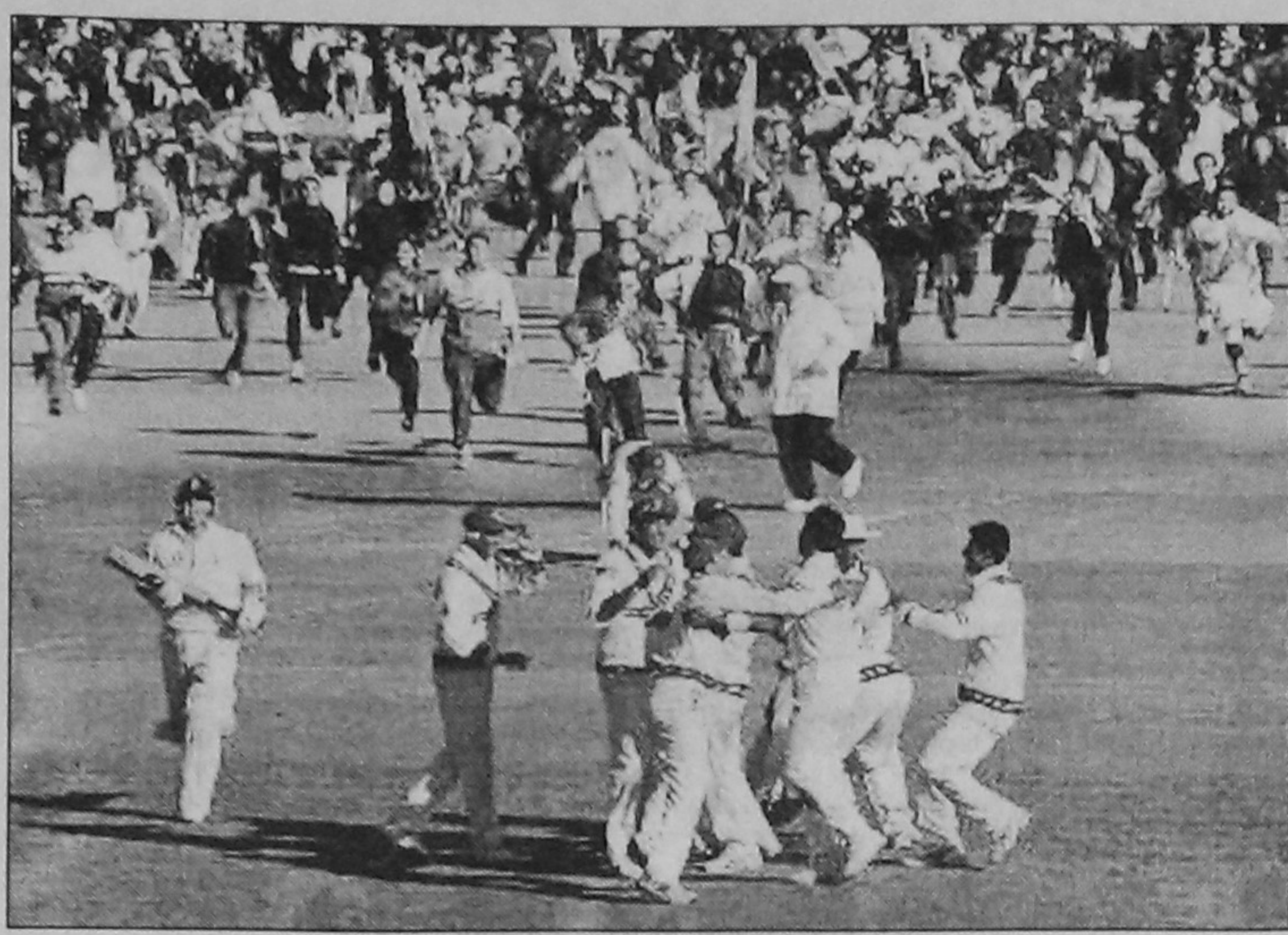
Pakistan cricketers celebrate their victory over England in the second Test at Old Trafford as crowd rushes towards them on June 4.